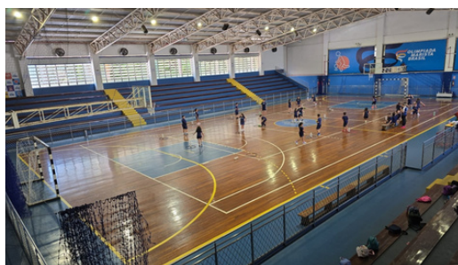
Ginasio do colégio Marista de Brasília Ensino Medio - Maristinha

ASCAD – Associação dos Servidores da Câmara dos Deputados