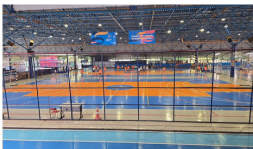
Ginasio do colégio Marista de Brasilia Ensino Medio - Maristão