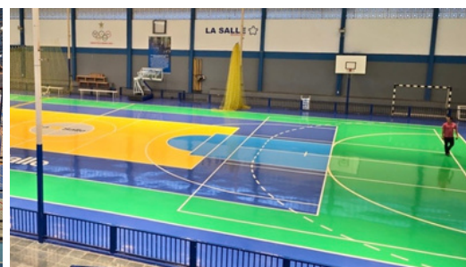
Ginasio do colégio La Salle de Brasília